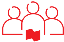
Investment experts from our entire Wealth Management group