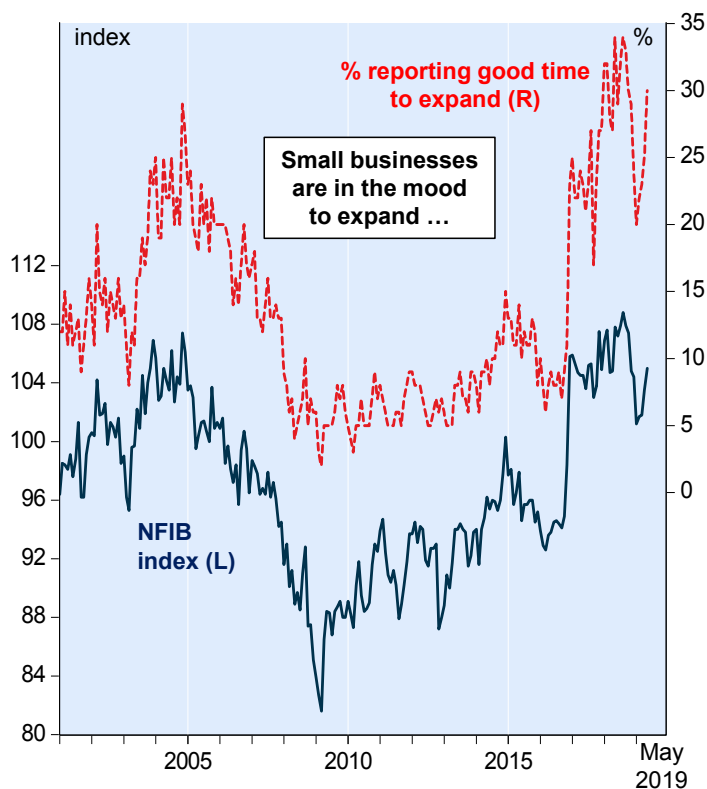
NFIB small business optimism index versus NFIB respondents saying now is a good time to expand