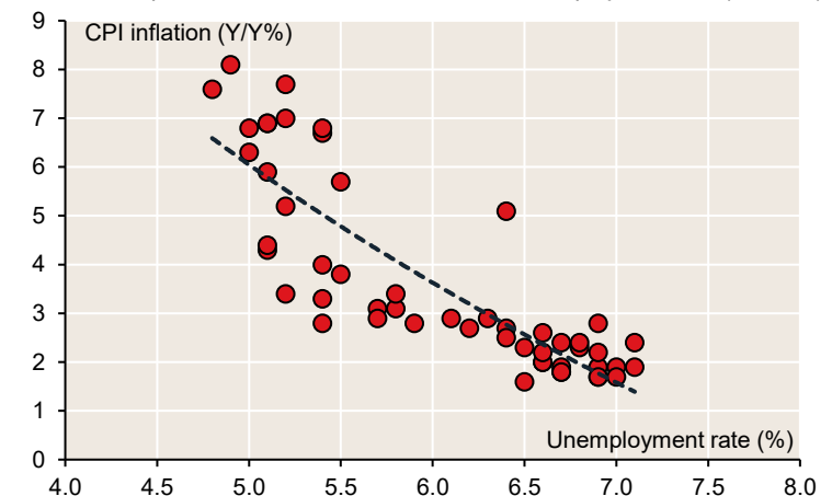
Canada Phillips curve: All-items CPI inflation vs. unemployment rate (2022-26)