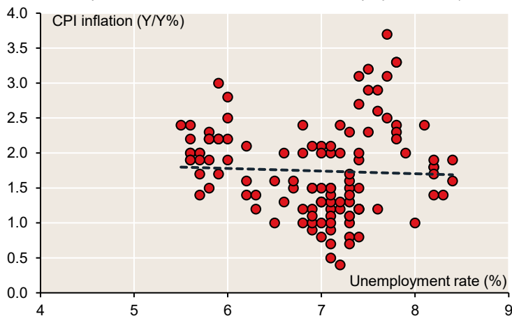
Canada Phillips curve: All-items CPI inflation vs. unemployment rate (2010-19)